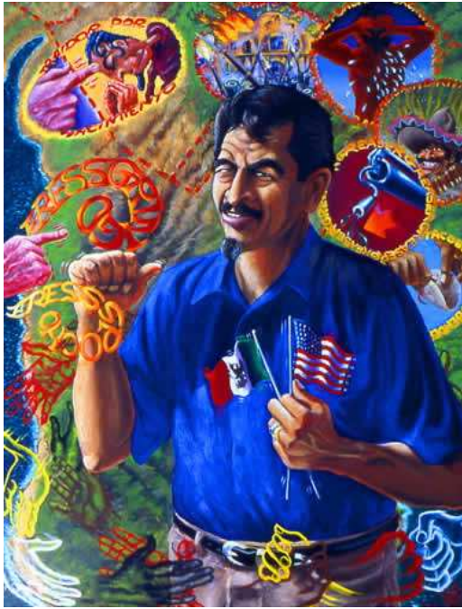
Figure 1 No soy Chicano, soy Aztlano! , 1998 (oil on canvas, 152x122 cm). Joe Diaz Collection. ©Alfred J. Quiroz

The title of this 1998 work (Figure 1) is No soy Chicano, soy Aztlano! (I am not Chicano, I am Aztlano).