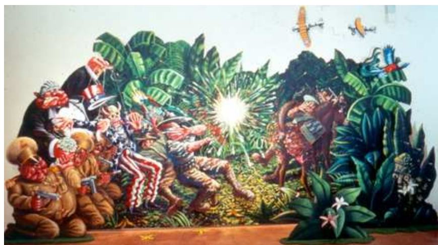
Figure 5 A Slip-Up Slows Da Search Fo’ Sandino-1932 , 1989, Medal of Honor Series #14 (oil and glitter with mixed media on masonite, 244x503x122 cm). Collection of the artist. ©Alfred J. Quiroz

Quiroz unleashed more aggressive postures toward individual histories of Medal of Honor recipients. The fourteenth painting in this series, titled A Slip-Up Slows Da Search Fo’ Sandino-1932 (Figure 5), was created in 1989. Military history, especially when it is an official variety, tends to recount stories of gallantry and