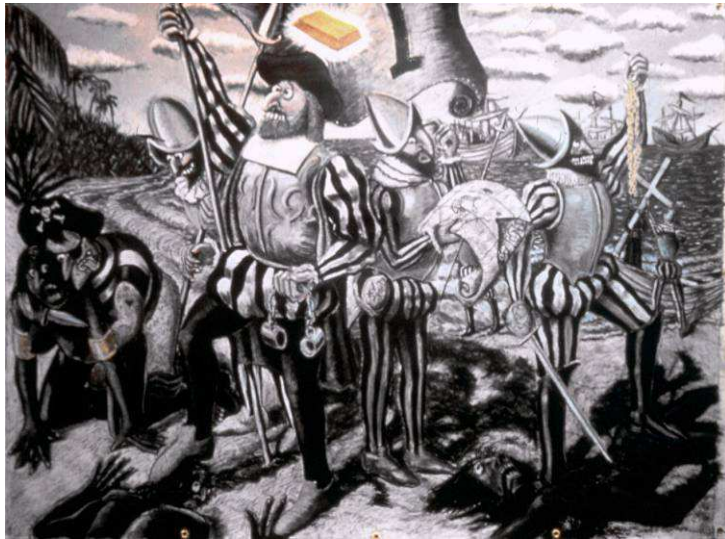
Figure 3 Christopher Columbus Discovers America and Introduces the Spanish Language , 1990, Happy Quincentenary Series (oil pastel, graphite and acrylic on paper, 152x228 cm). Collection Scottsdale Museum of Contemporary Art. ©Alfred J. Quiroz

The Spanish encomendero in Quiroz’s painting sits on the back of a native American. The dog to the left leaps for a bite of fresh meat from a severed hand. The Spanish conquistador rests his foot on the head of the butchered Indian. An obese cleric of the collaborating Catholic church serves as a buttress for the encomendero . His bulging eyes and salivating chops anticipate a gluttonous feast of the near-naked native American woman who