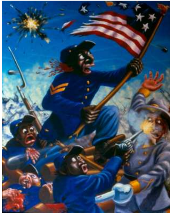
Figure 4 Gotta Save Dose Collahs , 1982, Medal of Honor Series #1 (oil on canvas, 152x122 cm). Collection of the artist. ©Alfred J. Quiroz

Quiroz likes to work in series. One of his most powerful bodies of work includes fifteen large paintings developed in response to citations for United States military heroes who won the prestigious Medal of Honor. The first in this series, Gotta Save Dose Collahs , painted in 1982,