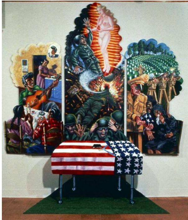
Figure 6 Allá en el Rancho Grande, 1990, Medal of Honor Series #15 (oil on canvas and masonite with mixed media, 361x324x91 cm). Collection of the artist.