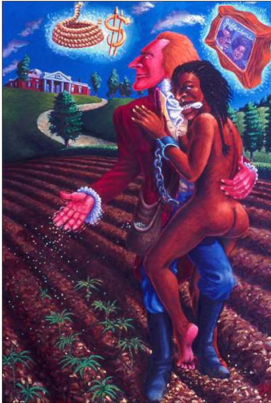
Figure 8 TJ Sows the Seeds, 1999, Presidential Series (oil on canvas, 152x122). Collection of the artist.

of significance in recent debates of Jefferson's intimacies with Hemings, is not how many children he fathered or the fact of his "illicit" relationship, but the intensity of the defense for Jefferson's actions. And much has been made in the literature about how "white" or European Sally Hemings looked.