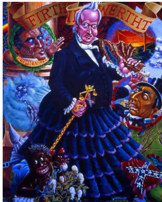
Figure 7 The Firht and Wirtht, 2000, Presidential Series (oil on canvas, 208x170 cm). Collection of the artist.

The portrait on Buchanan's right, labeled "Miss Nancy" is that of his close friend, King. The chained African American slave holding some cotton, the confederate flag, and the Ku Klux Klan member pointing a shotgun all refer to Buchanan as a "doughface" politician, that is a northern politician, he was from Pennsylvania, who supported southern political positions, especially the right to own slaves. Perhaps this is no coincidence since his closest companion, King, was from Alabama. Buchanan holds a turkey leg in the shape of Mexico and, behind, a picturesque sunset by the San Francisco Bay bridge serves as a reminder of Buchanan's role as then Secretary of State in the United States war against Mexico and his rejection of the Treaty of Guadalupe Hidalgo in favor of taking over a far greater range of Mexican territory. An ironic medallion, a portrait of Benito Juarez reaching for the leg of meat, contrasts poignantly with Buchanan's appetite.